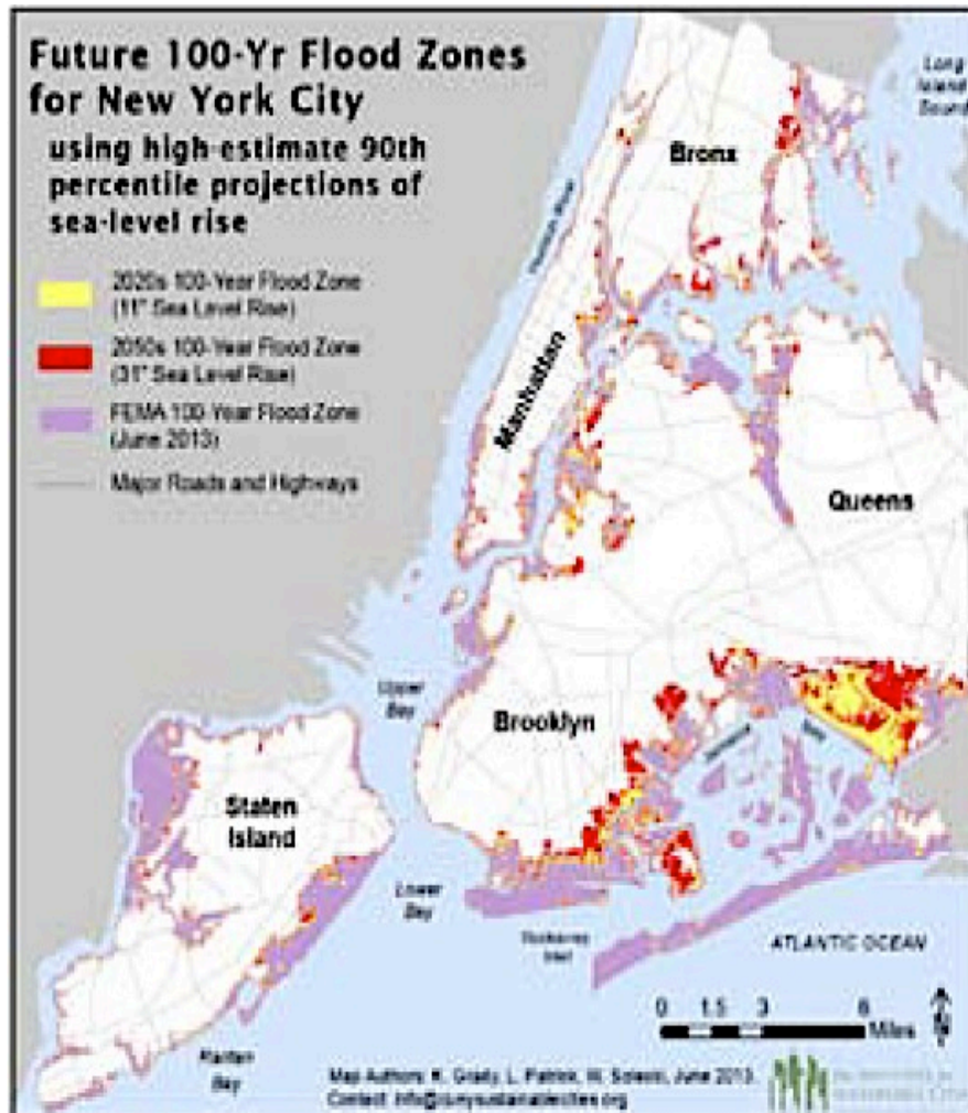
Figure 4. “The potential areas that could be impacted by the 100-Year flood in the 2020s and 2050s based on projections of the high-estimate 90th percentile sea level rise scenario.” NPCC, supra note 20 at 6. (The June 2013 estimated 100-year-flood zone parallels FEMA’s 1983 100-year-floodplain for NYC in addition to the area inundated by Hurricane Sandy. See Figure 3.)