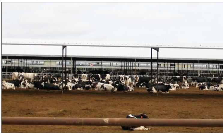
Gestating milk cows loaf on dirt lots before being moved into the dairy operation for milking once they have had their calves. Cows in these operations do not have the opportunity to graze on pasture.

the United States, and manure management is the fastest growing major source of methane, increasing by more than 50 percent between 1990 and 2008. 34