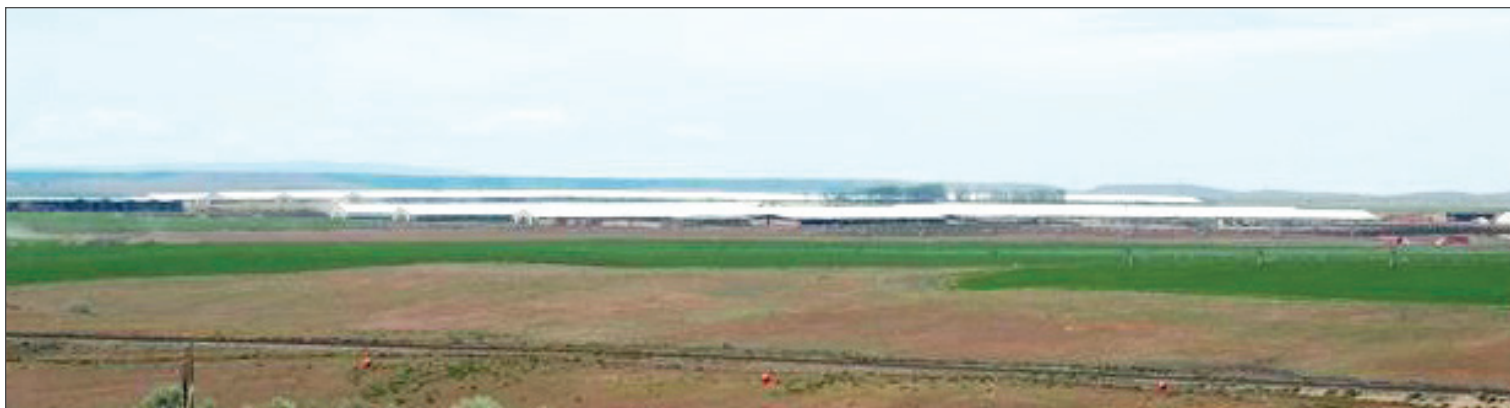
The Threemile Canyon Farm complex where massive barns contain tens of thousands of cattle.