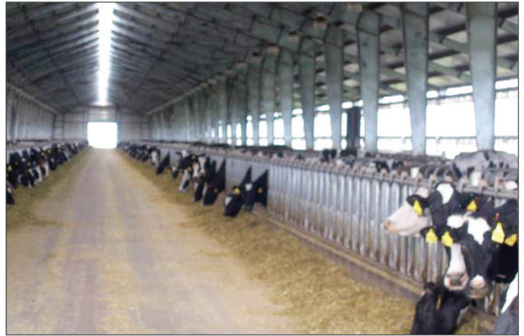
Dairy cattle are fed nutrient dense diets to increase milk production. The rich diets lead to an increase in the amount of gases emitted by each cow, which can contribute to global warming.

Large dairy CAFOs have the potential to threaten entire communities. One 1,500-cow dairy in Minnesota re-