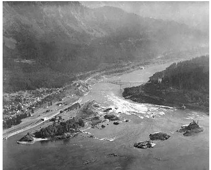
Cascade Locks and Falls prior to Bonneville.

These changes were very, very harmful to Yakama Nation in terms of how they affected not only the water, but also the